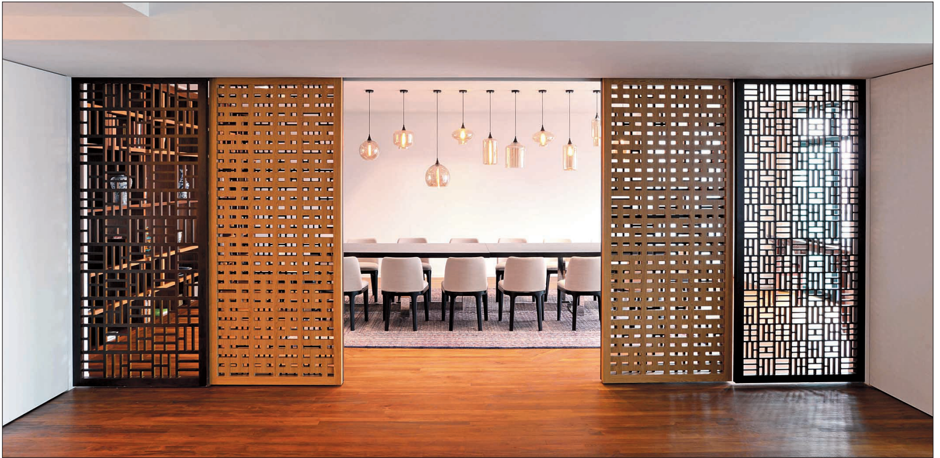
The dining room is a space of refinement inspired by traditional Chinese culture.